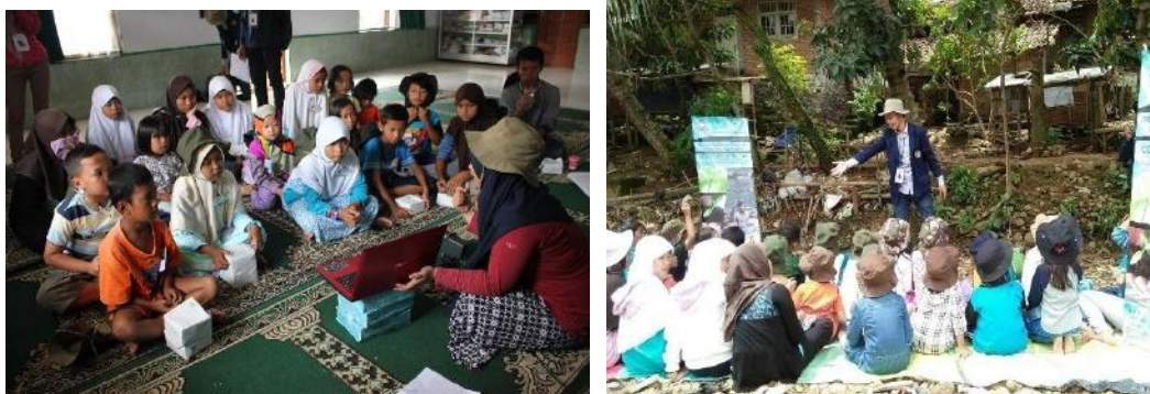
Figure 4. Education activity

Educational activities are conducted with the aim of providing a comprehensive understanding to the participants on how to manage the environment properly and correctly through the application of COBOY game media. The results achieved in this activity is a change in the pattern of positive behavior of participants and increased motivation of participants to maintain and manage the surrounding environment. In addition, participants can create the creation of used goods.. Then, another outcome of this activity is the drafting of the COBOY game manual and a collection of environmental knowledge for participants to empower the surrounding community in managing the environment through a positive environmental action approach.