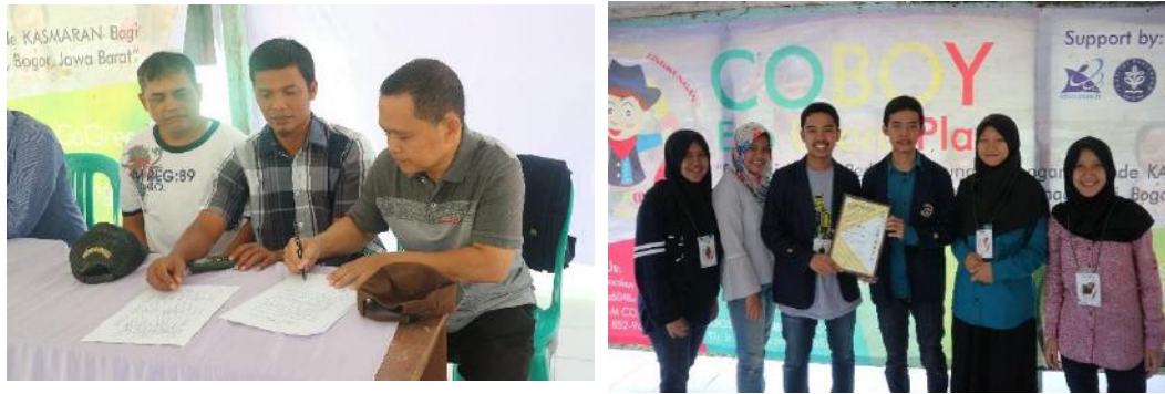
Figure 5. Advocacy activity