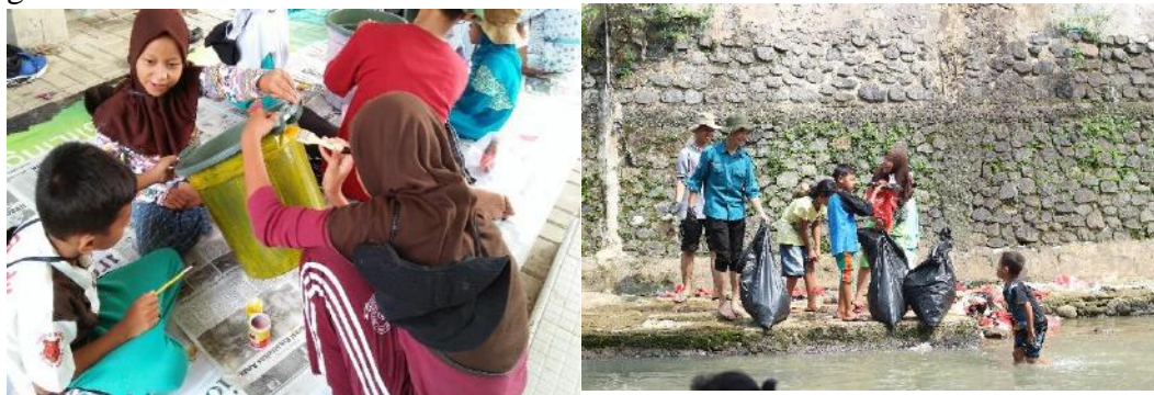
Figure 6. Action activity

This activity is done by carried out river cleaning action by participants, and activities of utilization of used goods to become creative products that are environmental friendly. The result of action activity is increasing knowledge and attitude to environment such as knowing how to planting good and correct seedlings, able to sort the waste by its kind and able to utilize plastic waste for making pot vertical garden.