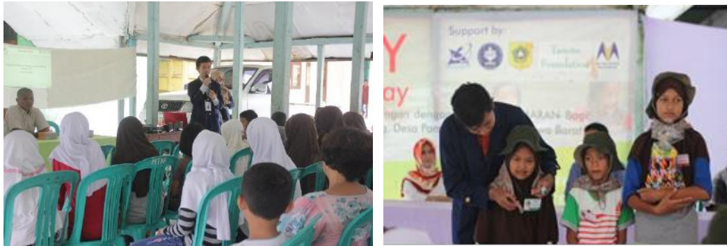
Figure 3. Socialization activity